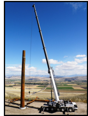
Rick Hull Grove GMK 5165