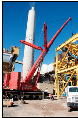
Roy Justice Liebherr LTM 1400