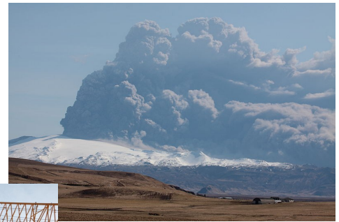
Eyjafjallajokull volcano 4/18/10.